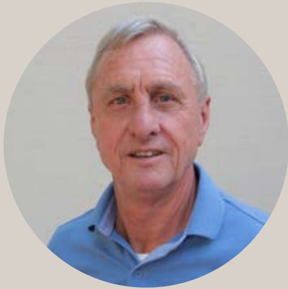
Johan Cruyff Founder