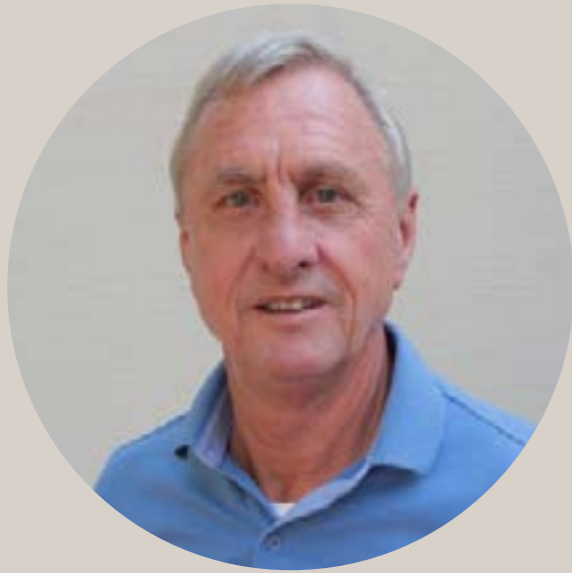
Johan Cruyff Founder